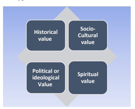
Fig. 3: Aesthetic Values.

will appeal to everyone because of the vast range of mediums and techniques used (Goldman, 1990). Contemporary artwork has aesthetic value and can be utilised to decorate a wide range of spaces. Art can be found even in outdoor sculpture, where it can be readily viewed by the public and enhance the urban environment.